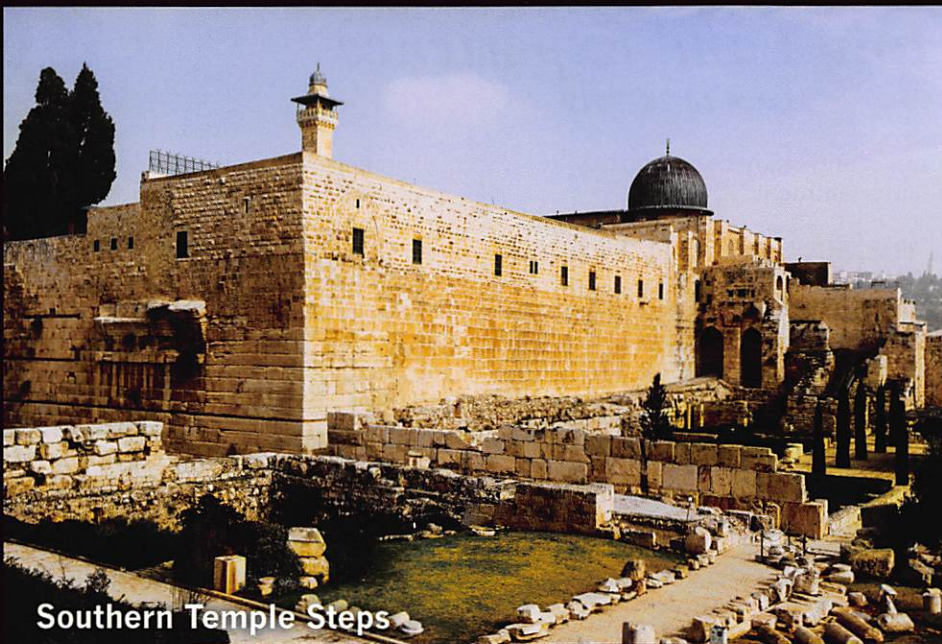
Southern Temple Steps