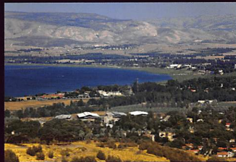
Sea of Galilee