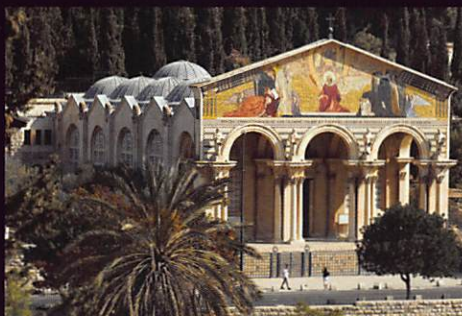
Church of all Nations

NOTE: Operator reserves the right to alter any part of this program.