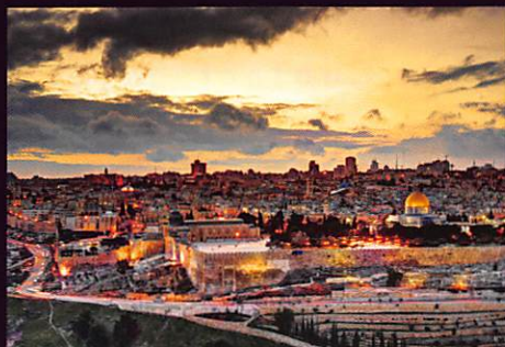
Sunset over Jerusalem